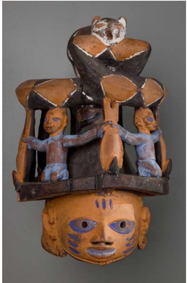
Gelede mask c.1930–40

A variety of masquerades aid Yoruba communities in communicating with the spirit world, while entertaining the living. Gelede festivals celebrate women and motherhood. These festivals are meant to honor the power and authority of females and ensure fertility. Gelede performances take place each year at the beginning of the agricultural season. Men play the role of women, wearing elaborate costumes and masks similar to those of an Egungun masquerade, which honors ancestors. The Gelede festival entails a sequence of dances, which begin with a series of nighttime performances and rituals known as Efe. On the day of the Gelede performance, a number of masquerades take place, which are performed in order of age, the youngest appearing first. Egungun and other Yoruba maskers hide their identities and speak in disguised voices. The Gelede masker, however, may unmask in public and speaks in a natural voice.