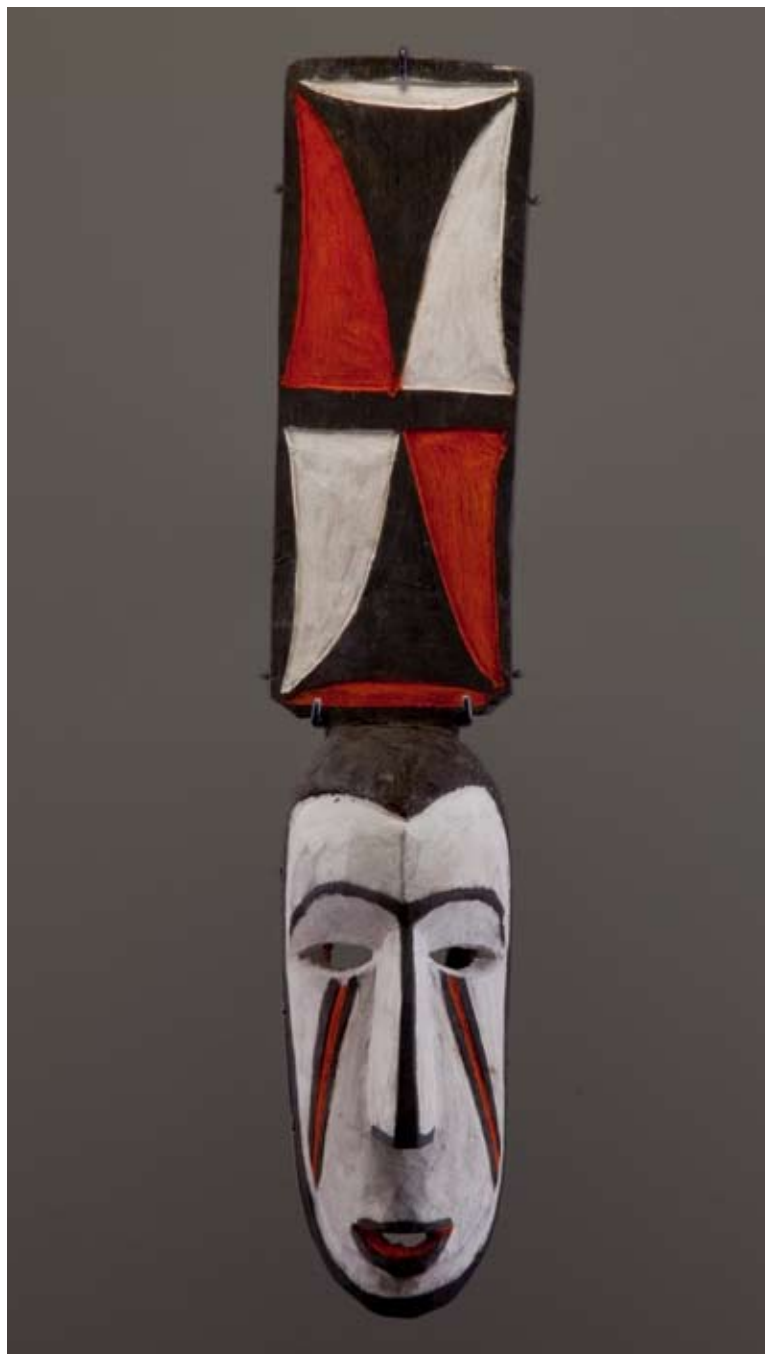
Mba mask 1959–60

In contrast, njenji , performed during the dry season festival, is a parade made up of young men. The masked performers walk in a line, arranged in order of descending age. The men are organized by the type of mask that they wear. Many performers are dressed in costumes that make them appear as females. Some walk side-by-side as couples, dressed as a man and wife, sometimes in European dress. Other maskers are dressed as scholars or priests. Masked singers are the only musical accompaniment to the parade.