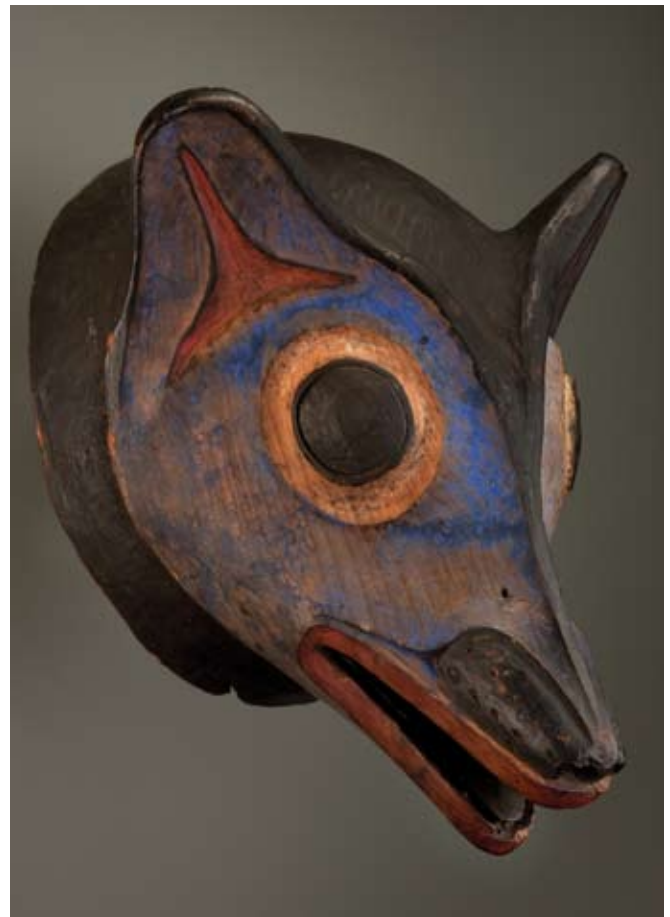
Mask early 1900s Tlingit Northwest Coast wood, pigments 2-4771; L2010.1801.006

include numerous costumed performers dancing and performing symbolic gestures while being accompanied by musical instruments such as flutes, rattles, drums, and chorus singers. When not in use, masks were carefully stored until the next performance.