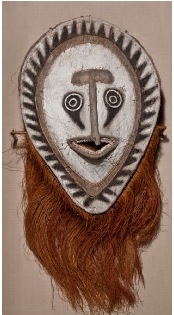
Mask before 1960 probably Elema people Orokolo Village, New Guinea, Melanesia bark cloth, pigments, lime, fiber 11-37414; L2010.1801.097

The Elema people of the Papuan Gulf region of New Guinea once participated in a cycle of masked rituals that revered water spirits known as ma hevehe . The most significant mask used in this ritual was the enormous mask known as the hevehe . Counterbalancing this sacred mask was the eharo , literally “dance head” or “dance mask,” a brightly painted oval-shaped mask made from bark cloth stretched over a framework of cane. These masks, though part of an important ceremonial cycle, served the purpose of entertaining spectators. Most eharo depicted aulari —the ancestral spirits associated with individual familial clans. Other eharo portrayed spirits and characters inspired by local oral tradition.