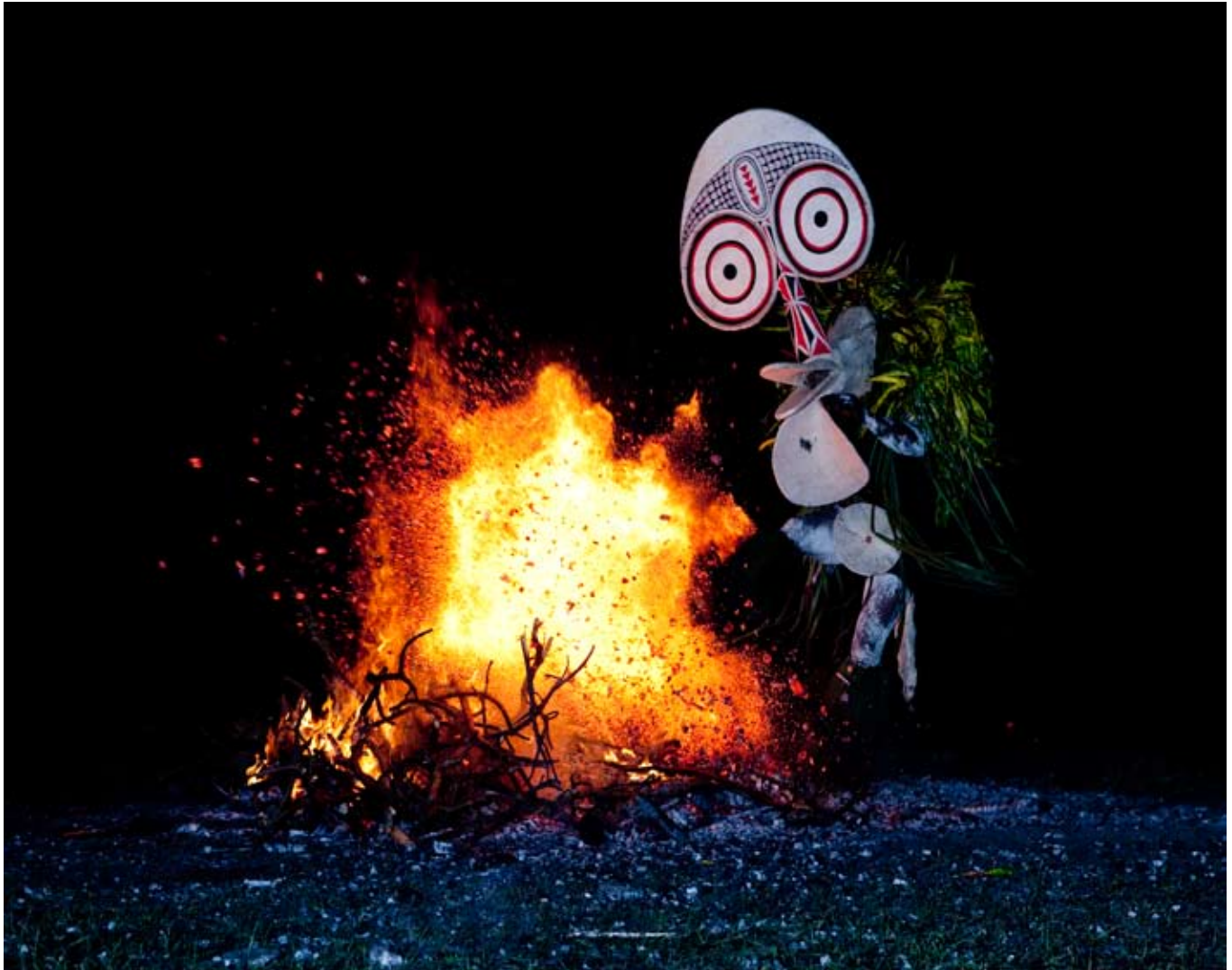
Baining fire dance ; New Britain , Papua New Guinea, 2009.

The Baining people use these masks in a night dance, also referred to as the snake dance. In spectacular performances, men bravely dance around and through a fire in cleared village dance grounds. Night dances were originally concerned with male