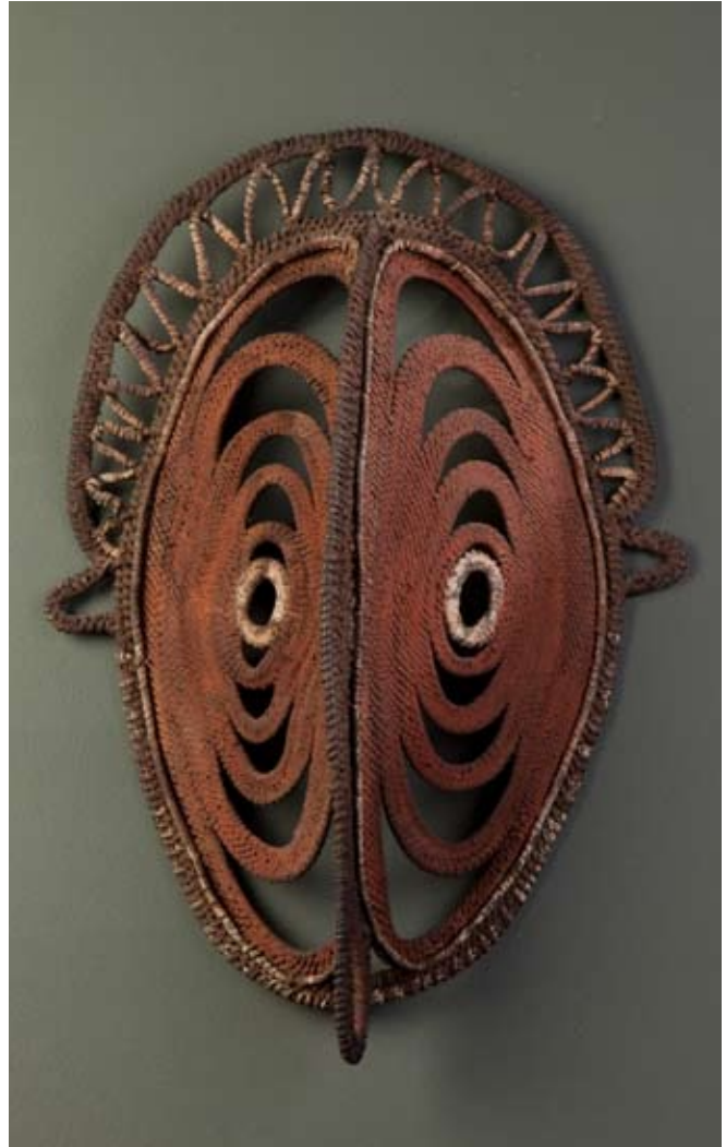
Yam mask probably 1900–60 probably Abelam New Guinea, Melanesia plant fibers, pigments 11–42928; L2010.1801.101

Men weave yam masks. A skilled weaver produces masks that are tightly woven with easily recognizable characteristics that clearly convey the spirit of the ancestor. Paint, dyes, and clay pigments provide the finishing touches and transform the masks from an inanimate object to a living ancestor spirit. Masks are typically cleaned and recolored after each ceremony.