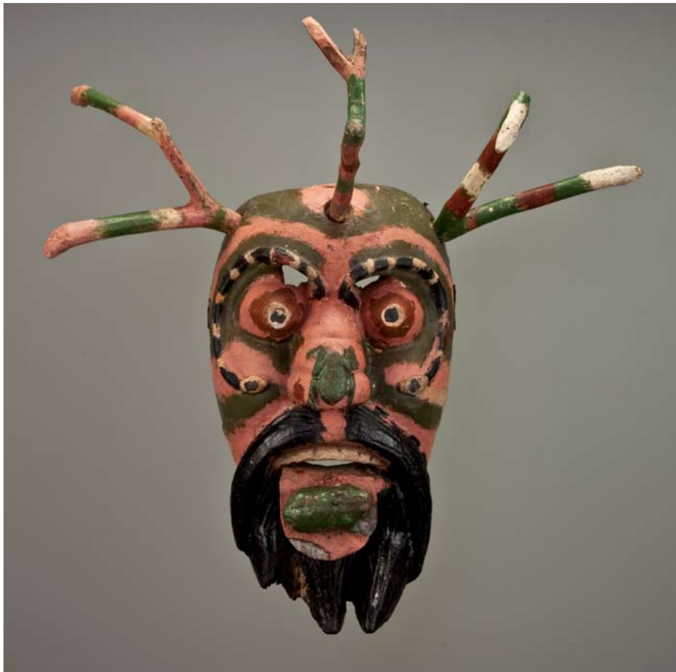
Devil mask before 1950