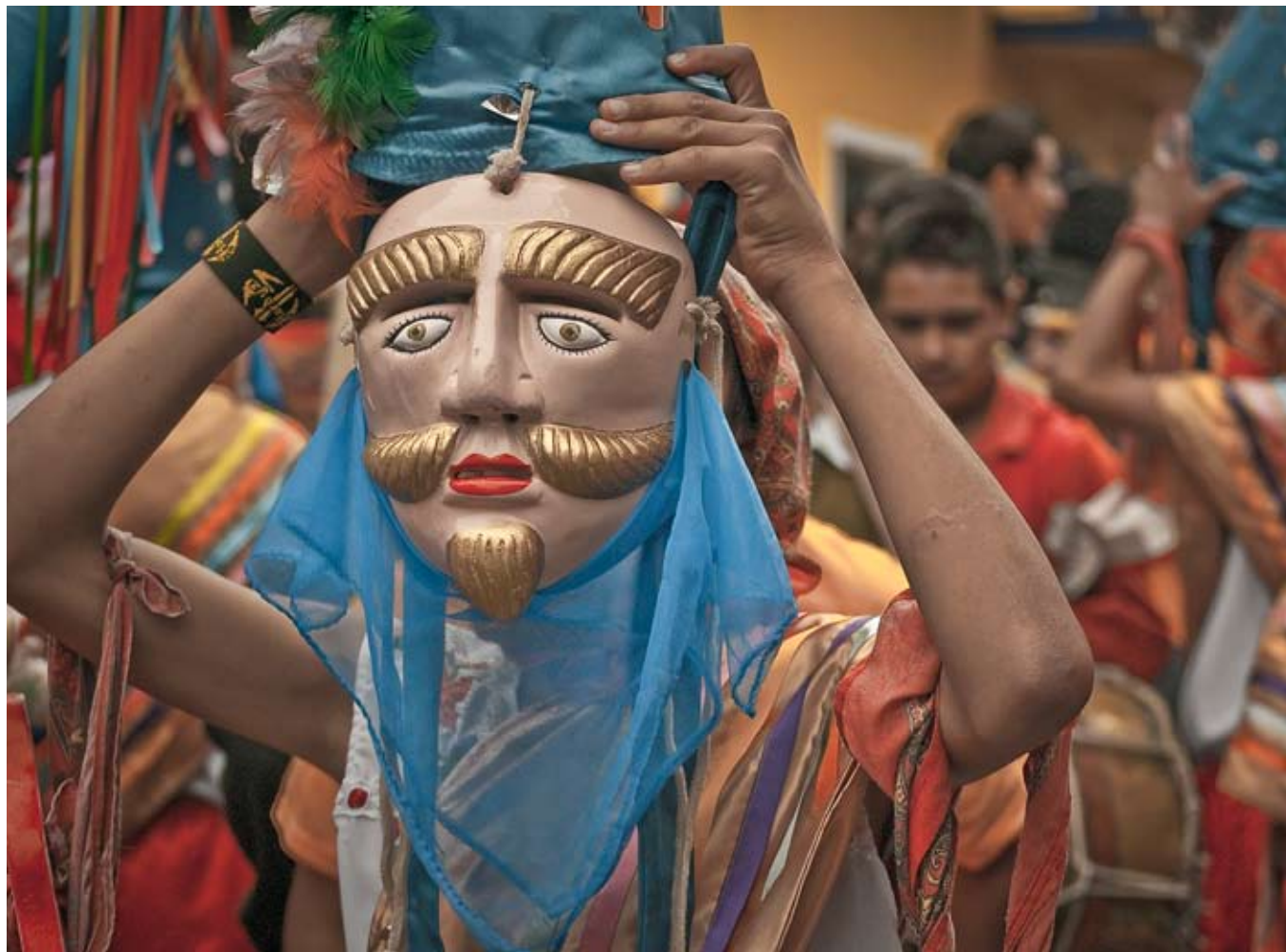
Dance of the Moors and Christians; Naolinco town, Veracruz, Mexico, 2009.

Masks are perhaps the most elaborate of the ceremonial arts in Mexico. Indigenous traditions of masking were overlaid with Catholic influences brought by the Spanish. Today, masks are found primarily in the southern, central, and northwestern states of Mexico, areas containing substantial Indian populations.