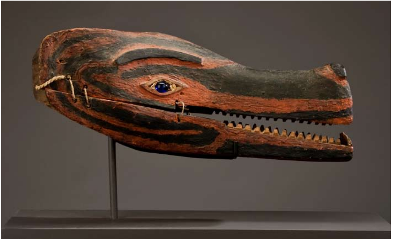
Wolf mask before 1889