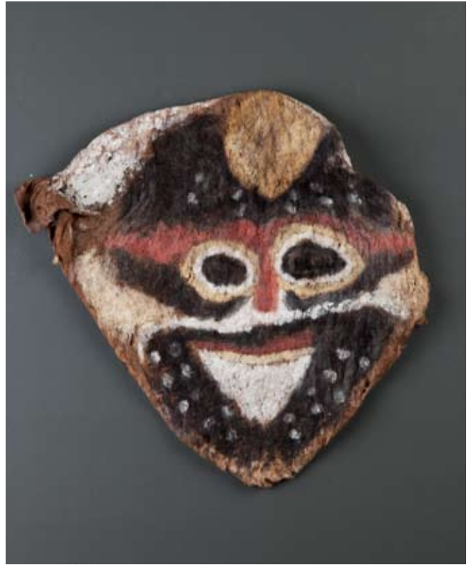
Mask before 1969

The people of Melanesia have produced a remarkable variety of masks in a wide range of styles and sizes. Historically, masked performances portrayed important ancestors, spirits, and other supernatural beings. The entire community could view certain masks, while others were seen only by initiated men. Masked ancestral spirits were invoked during masquerades performed for important occasions, such as the building of a ceremonial house, construction of a ceremonial canoe, or the initiation of young men into secret societies. Masquerades were performed for young male initiates to explain history, mythology, and important aspects of religion. Masked performances also took place throughout the year for the education and entertainment of the entire village. Masks representing ancestral spirits were responsible for promoting the success of important activities such as agriculture, hunting, fishing, and warfare in addition to funerary, fertility, birth, and name-giving ceremonies.